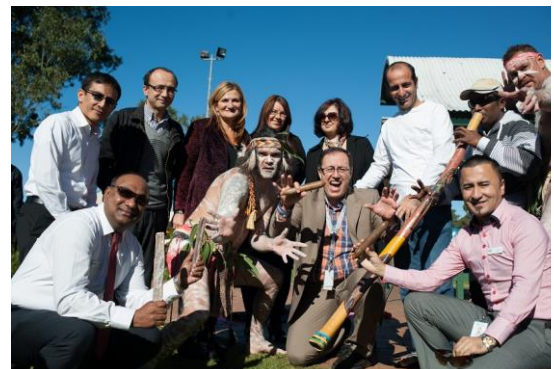
Above: SSI staff and clients