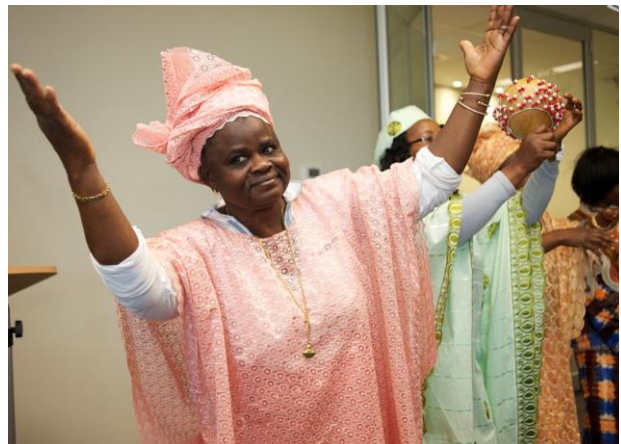
Members of the Sierra Leone Cultural Dance Group