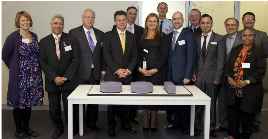
Senator Matt Thistlethwaite & Violet Roumeliotis (centre) with special guests

The launch of the SSI head office in Ashfield on July 3 was a special and significant milestone for the organisation.