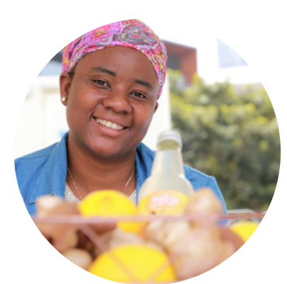
For just $25/month you could help provide hot meals and social cohesion activities for marginalised individuals at SSI's Comminity Kitchen.